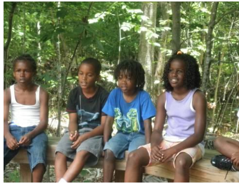
Helping Hands Camp participants visited in Summer 2011. Field trip sponsored by Friends of Hemlock Bluffs.

In 2001, board members felt that local citizens should know that this organization's mission is to support the nature center, the nature preserve, the environmental education programs, events and projects; therefore the board adopted the name Friends of Hemlock Bluffs . The members or "Friends" are asked to provide additional financial support and participate in organizational activities.